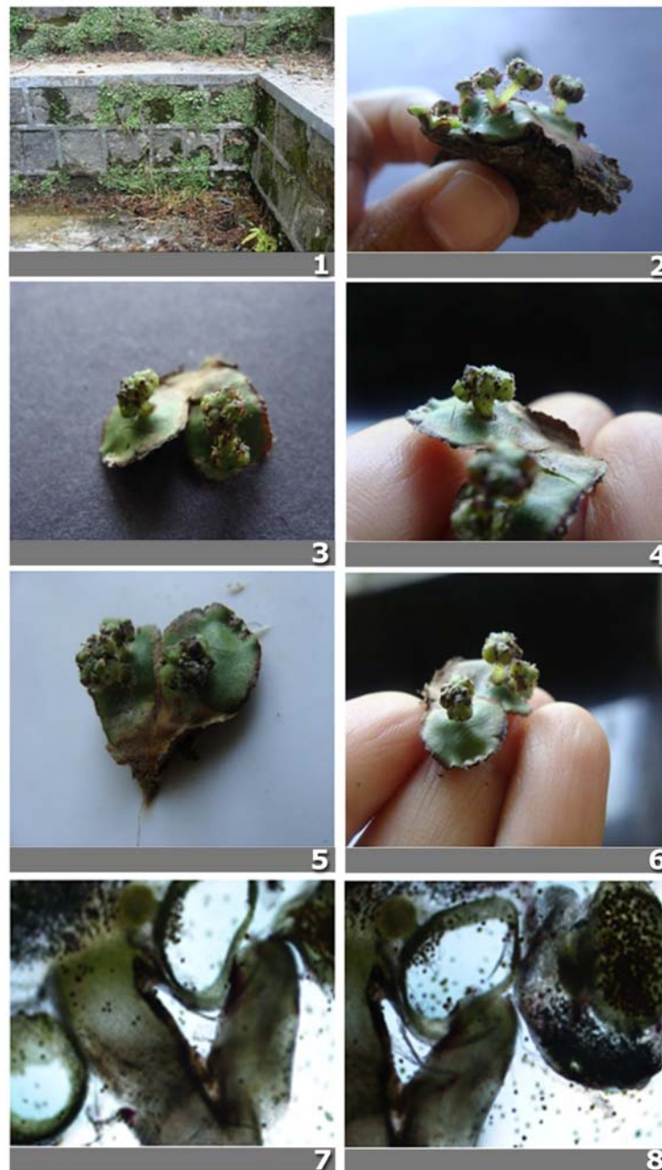
Fig. 1 . Population inhabiting epilithic habitat. Fig. 2. Thallus bearing dichotomously branched stalk. Fig. 3. Dichotomously branched stalk having tetralobed and trilobed discs. Figs. 4-6. Receptacle showing fused stalk and disc. Note the presence of trilobed and hexalobed discs. Fig. 7. V.S of receptacle passing through the dichotomously branched stalk and the fertile lobes. Fig. 8. Shows V.S of receptacle passing through the fertile lobes.