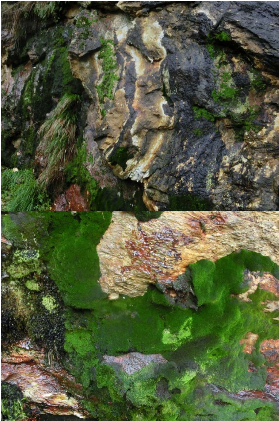
Figs. 4-5: Heavy metal rocks at La Polla, with Scopelophila ligulata (dark green) and Mielichhoferia mielichhoferi (light green).