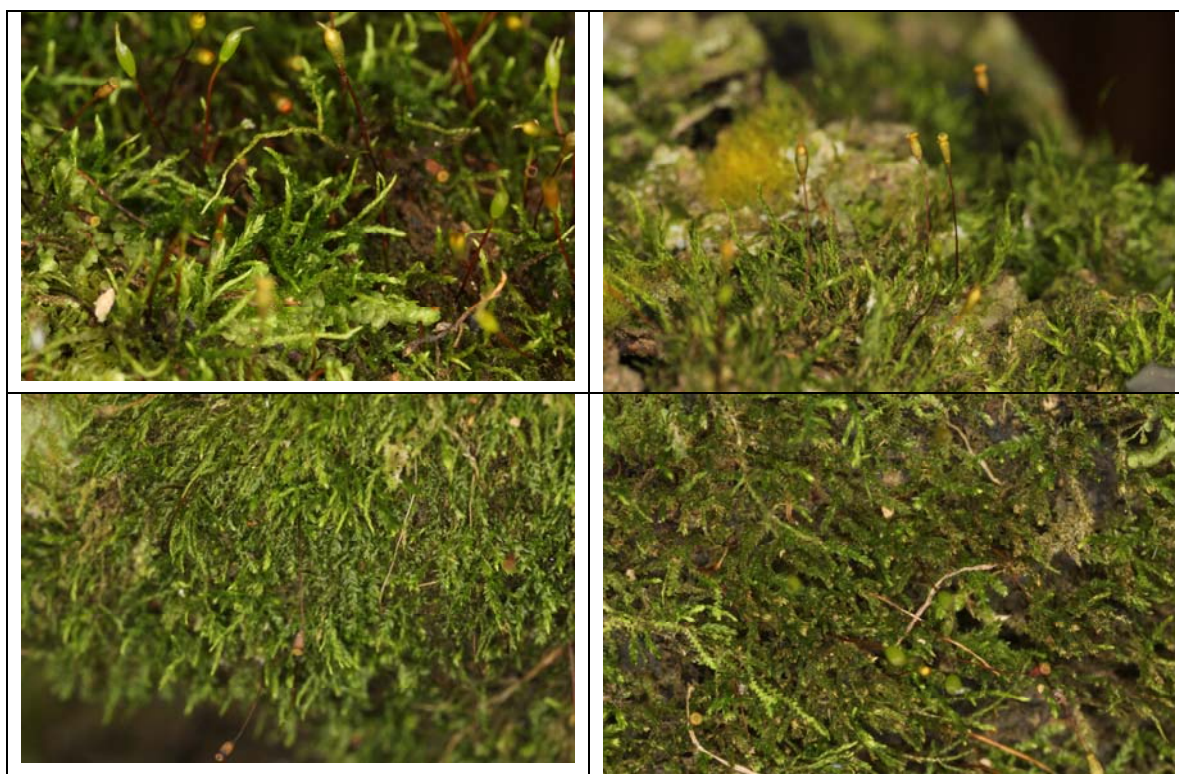
Fig. 4-7: Helicodontium capillare from Dominican Republic.