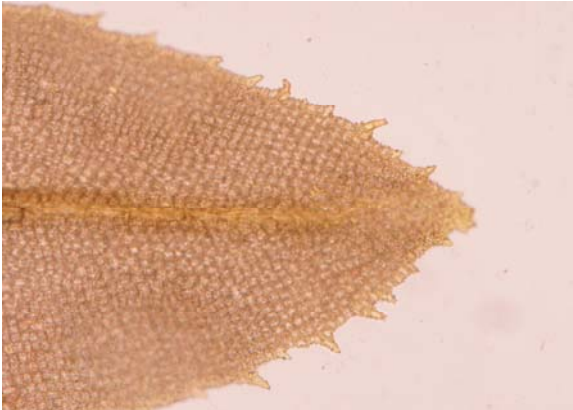
Fig. 5: Leaf apex of L. styriacum , Switzerland, Guttannen. There is no hyaline terminal cell as in L. flexifolium and the leaf shape is intermediate between L. flexifolium and styriacum .