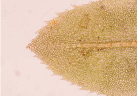
Fig. 3: Leaf apex of fig. 1.