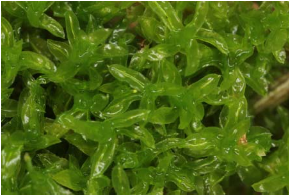
Fig. 1. Leptodontium flexifolium from Germany, NSG Buchheller.